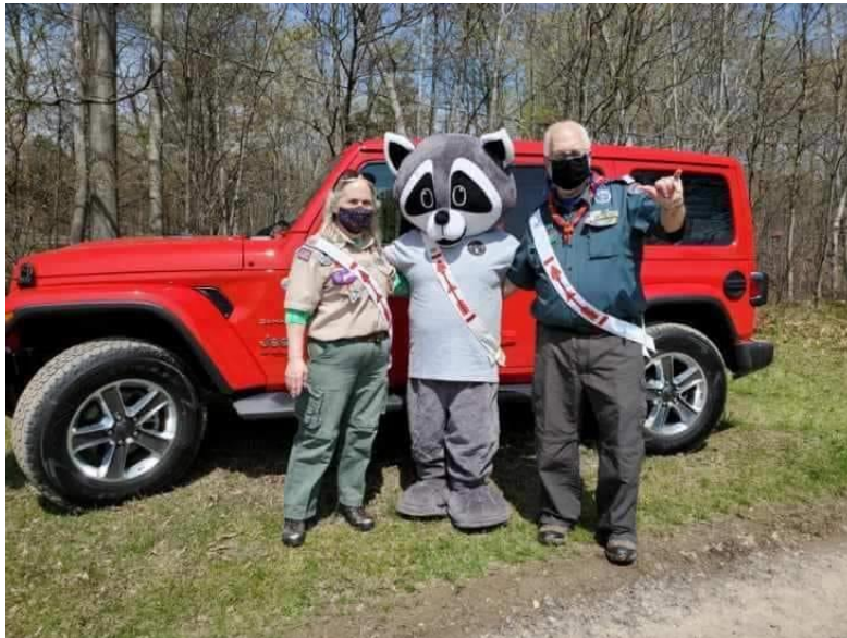
Our Camp Mascot trying to give away a new car! (He did not for the record...)