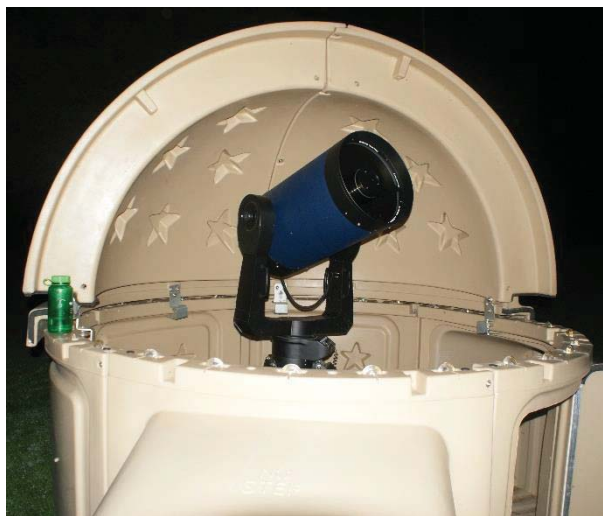
Telescope donated to the Sci-Tech Program